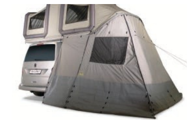
The usable area of the optionally available Awning has been enlarged to create even more space. Awning extenders available for large vehicles.