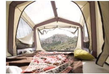
The gigantic interior has a volume of about 10 cubic meters (73 sq ft), the lying surface measures 340 x 190 cm.