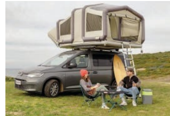
The tent is stabilized with telescopic ladders. One ladder is included in delivery.