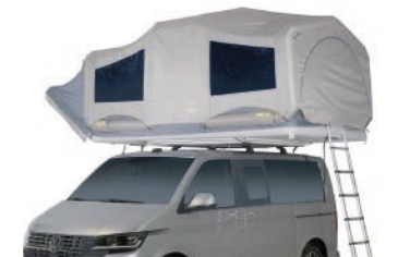
A UV-resistant outer cover protects bad weather and extreme heat or cold.