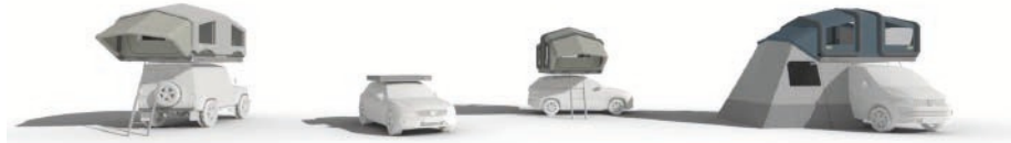
SUV & Off-roader Station-wagon Compact-class VAN & Mini-Van

The big one! | Glamping on the car roof | The best two room family rooftop tent