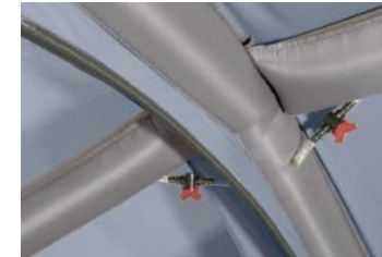
The "GT ONE VALVE TECHNOLOGY", makes handling even easier and allows for quick inflation.