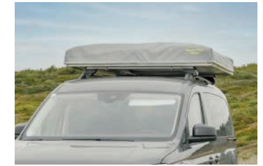
The tent with a packing size of 168 x 146 x 16 cm fits almost all common vehicle types.