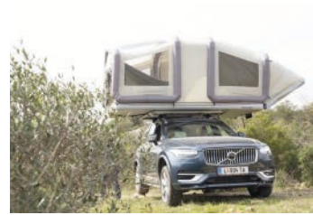
Great indoor climate thanks to breathable Polycotton material and large window openings with mosquito nets.