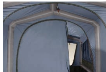
The GT SKY LOFT can be divided into two individual rooms, each with their own entrance.