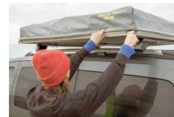
The aluminum frame features integrated inner rails for modern, extra wide or paneled roof racks.