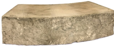
24 Tan Decorative Cellular Concrete Blocks