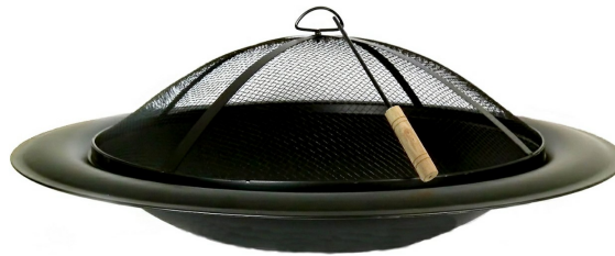
Acadia Fire Pit Metal Insert: