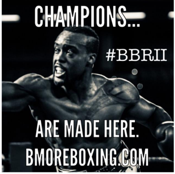
Facebook | Twitter | Instagram | Google+ | & MORE!

The integrated media plan and activation will generate over 2,000,000 Media Impressions via print, online, radio, television, social media and grassroots outreach. With online and social media being a primary focus we will reach millions nationally, regionally and locally.