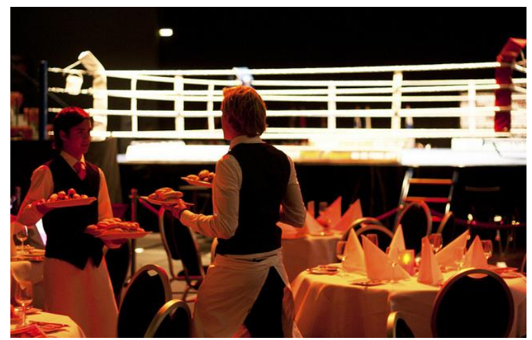
Exclusive VIP Reception and tables are reserved for our sponsors.

This Event will also feature a patented technology that will allow us to deliver the event to the masses in a manner never experienced before. Coupled with the luxurious backdrop of Martin's West Manor, the sum of the parts of this extravagant vision will cause an upscale event explosion within Baltimore and its surrounding areas, cities and states.