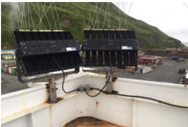
In-use Image of GAU-LTL-500W-LED Mounted

Durability: As well as unparalleled heat control, the GAU-LTL-500W-LED series of LED lights from Larson Electronics also offer IP67 rated construction that is designed to withstand extremes of environmental and operating conditions. These units can withstand rapid temperature changes of -40° Celsius to +80° Celsius, are waterproof, and resist ingress of dust, dirt and humidity. The housings are formed from die cast aluminum and the optics are high transmission PMMA with 98% light transmittance. Equipped with an acrylic lens, the CREE® LEDs help these units achieve resistance to vibrations and are rated at 70% lumen maintenance after 80,000 hours of use. We recommend these LED lights for use in applications where a lot of vibration, dust, dirt, dampness and abusive working conditions are encountered.