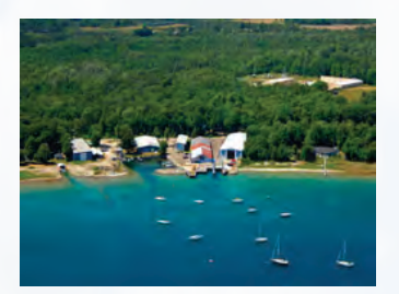
NORTHPORT BAY BOAT YARD, MI