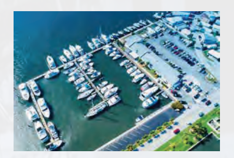
NETTLES ISLAND MARINA, FL