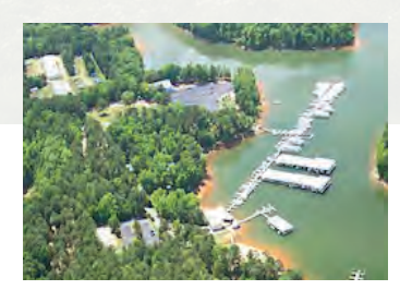
HIGHLAND MARINA AND RESORT, GA