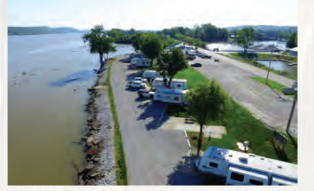
SMUGGLERS COVE MARINA AND CAMPGROUND, KY