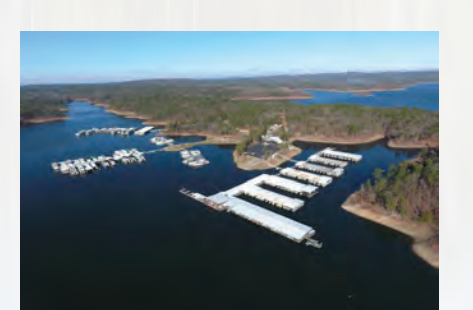
BEAVERS BEND MARINA, OK