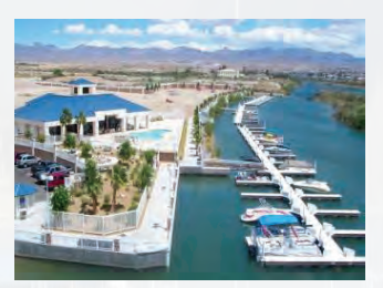
LAUGHLIN BAY MARINA, NV