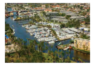
HURRICANE COVE MARINA, FL