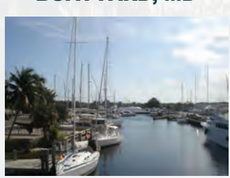
RIVERBEND MARINA, FL