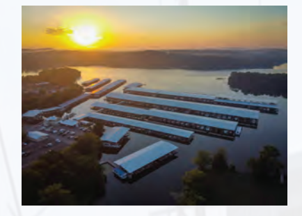
CEDAR CREEK MARINA AND RESORT, TN