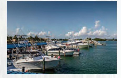
KEY COLONY MARINA, FL