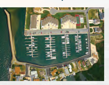
SOUTHSHORE MARINA, DE