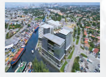
MARINA AND DEVELOPMENT SITE, FL