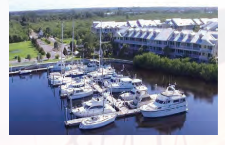
THE MARINAS AT LITTLE HARBOR - ANTIGUA COVE MARINA, FL