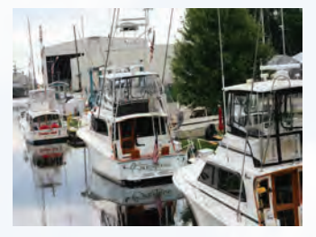
NESTEGG MARINA, WI