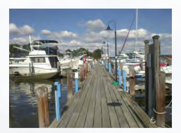
LANKFORD BAY MARINA, MD