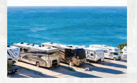
COCONUT CAY MARINA AND RV PARK, FL