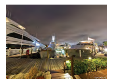
DAYTONA MARINA, FL