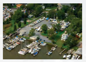
ROCKHOLD CREEK BOATYARD, MD