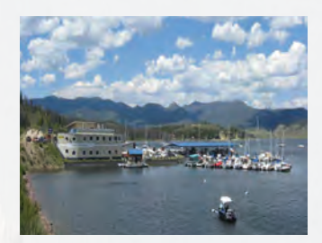
GRAND ELK MARINA, CO