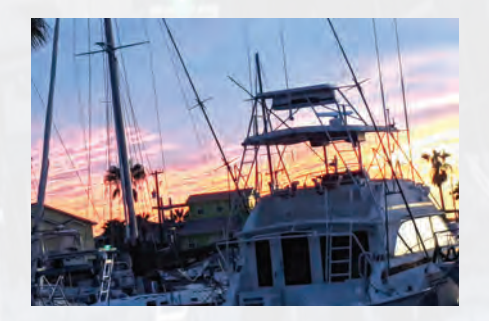
BAHIA MARINA, TX