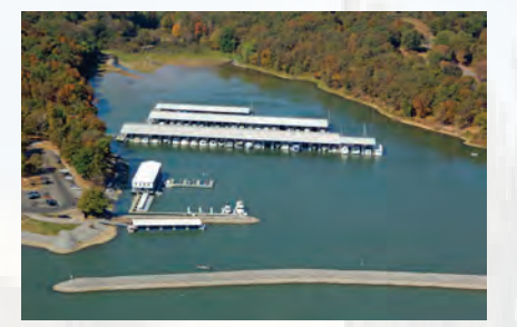
KENLAKE MARINA, KY