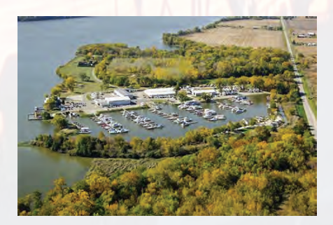
STARVED ROCK MARINA, IL