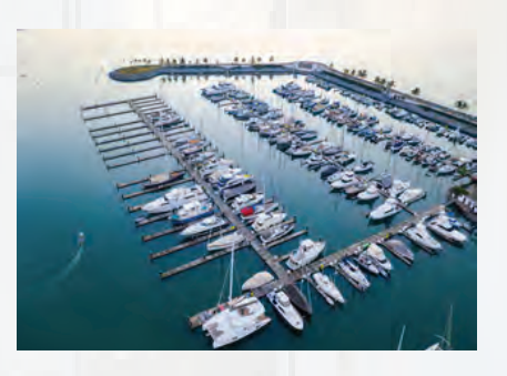
CONFIDENTIAL ARIZONA MARINA AND RV RESORT