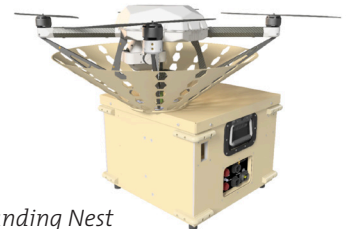
Tether Kit including Landing Nest