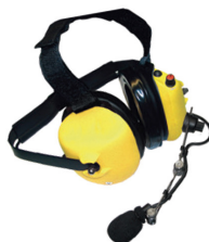
Heavyduty headset, noise canceling