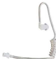
Acoustic tube "quick disconnect"