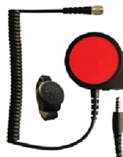
Cable with wireless finger PTT