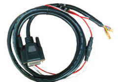
Interface extension cable