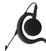
Large black earpiece