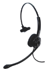
Lightweight headset, noise canceling