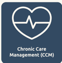
Chronic Care Management (CCM)