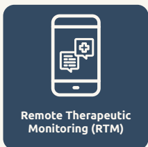
Remote Therapeutic Monitoring (RTM)