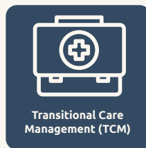
Transitional Care Management (TCM)