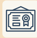
Academic Healthcare Facilities