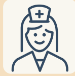
Skilled Nursing Facilities