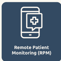
Remote Patient Monitoring (RPM)