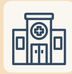
Integrated Delivery Networks (IDN)