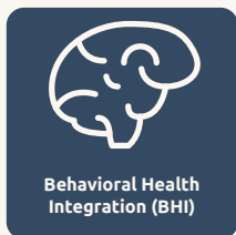
Behavioral Health Integration (BHI)