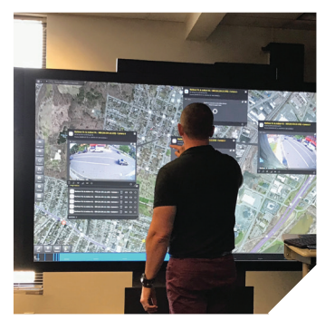
The team in C4 uses Live Earth as a realtime data visualization tool.