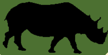
Black Rhino Ziwar Rhino Sanctuary