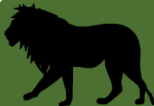
Tree Climbing Lion Queen Elizabeth National Park