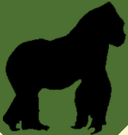
Mountain Gorilla Bwindi Forest National Park