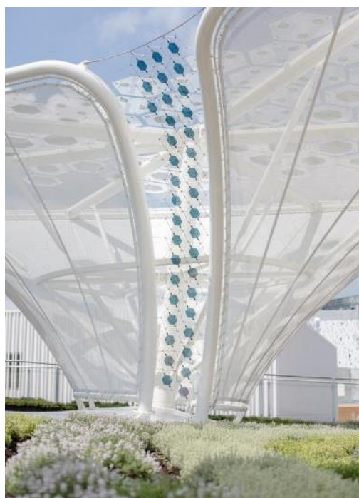
Picture: Solar modules from BELECTRIC OPV featuring Lapp connection technology have already contributed to the impressive look of the German pavilion at Expo 2015 in Milan.

Publication and reprint free of charge; specimen copy is requested.