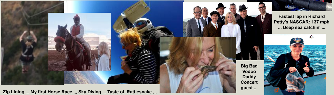
Zip Lining ... My first Horse Race ,, Sky Diving ... Taste of Rattlesnake ,,

P.S. ... and when I'm not working, I've been turning some of my "bucket list" thoughts into actual experiences: