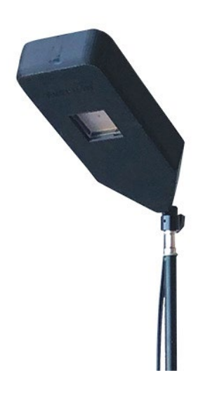
Krypton-Shield Floor Lamp