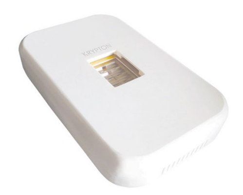
Krypton-36 Disinfection Light