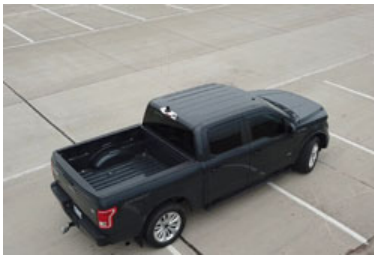
Click image to Enlarge