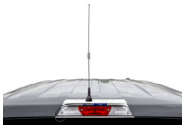
Aluminum Plate For Mounting Permanent Mount Antennas

Applications: Hunting, fishing, off-roading, property management, security, search and rescue, farming operations, law enforcement, DOT and any other applications for which a roof mounted antenna is needed for is 2009-2018 Dodge Ram trucks, 1500, 2500, and 3500 models.