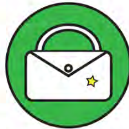
bags of all shapes