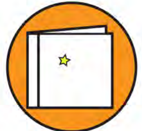
CD cases, etc.