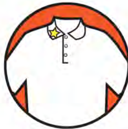
collar of a shirt