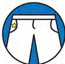
pockets of apparel