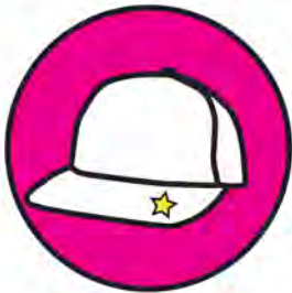
bill of a hat