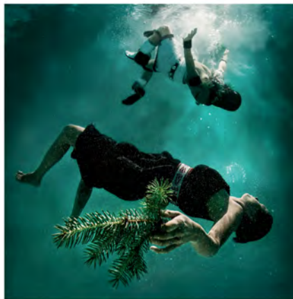
Cara Romero, Water Memory , 2015. Photo