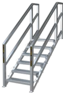
6 TO 10 STEPS