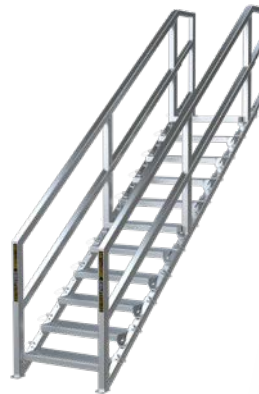
11 TO 16 STEPS