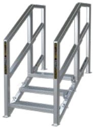
3 TO 5 STEPS

Smartstairs™ staircases can be configured to your needs, the possibilities are endless!