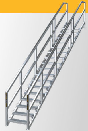
17 TO 21 STEPS