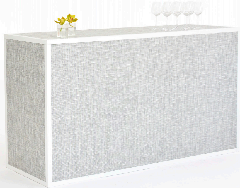
Chilewich Bar - White / Silver $350 per piece / 12 pcs each - NY & LA