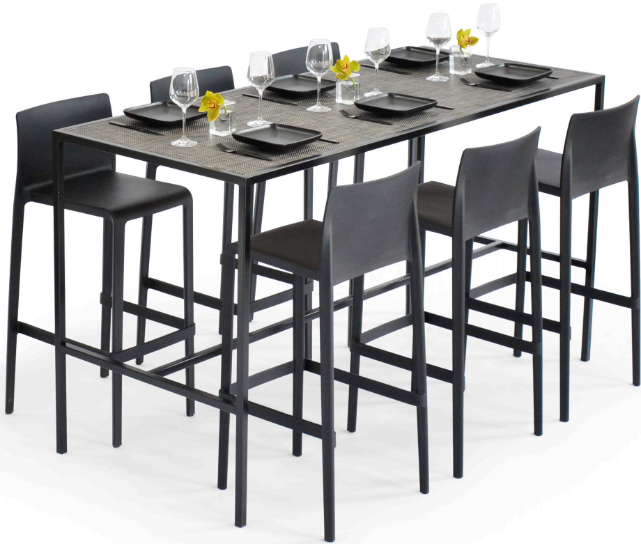
Communal Table - Chilewich Carbon $325 per piece / 20 pcs each - NY & LA