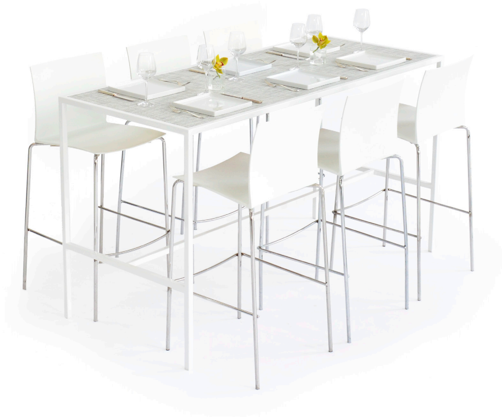
Communal Table - Chilewich White / Silver $325 per piece / 20 pcs each - NY & LA