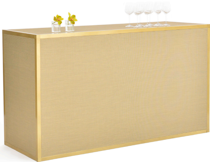
Chilewich Bar - New Gold $350 per piece / 12 pcs each - NY & LA