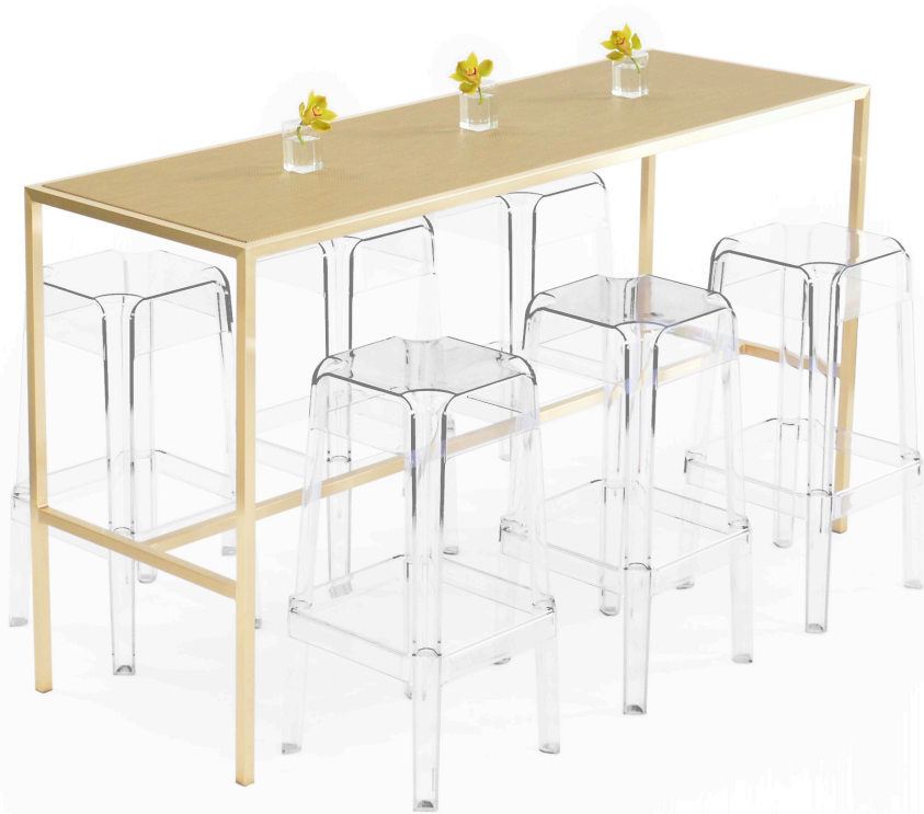
Maxwell Runner Table - Chilewich New Gold $395 per piece / 20 pcs each - NY & LA