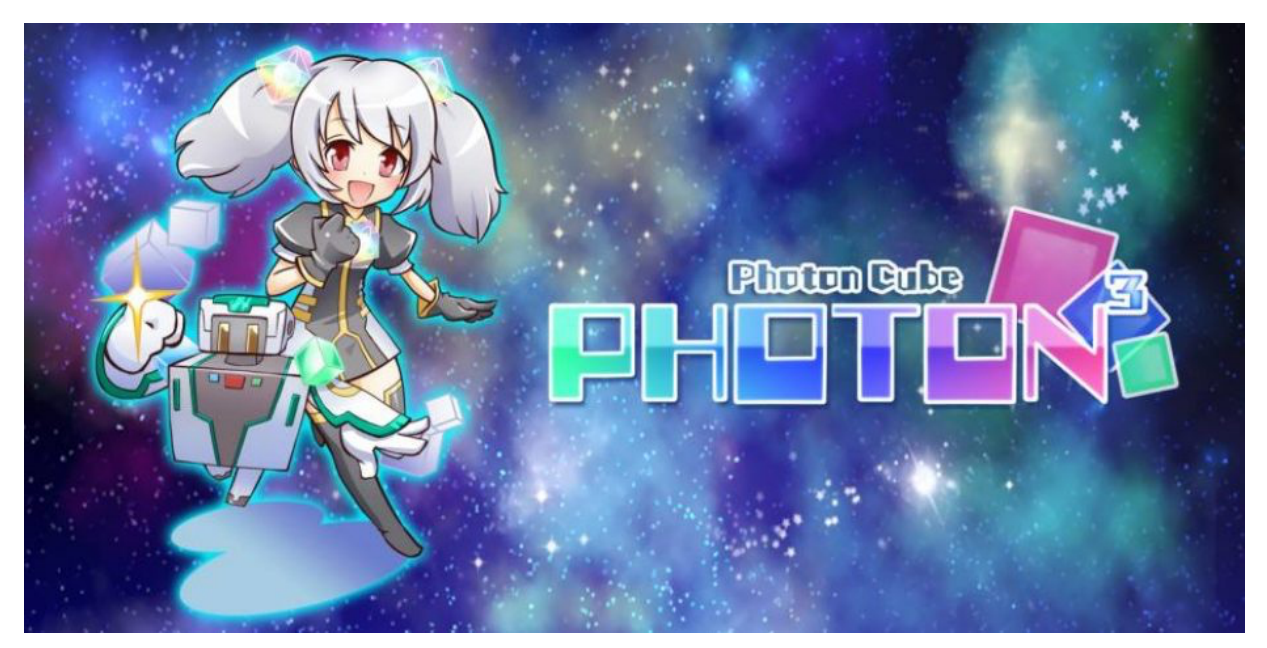
Web oficial: https://www.smileaxe.com/photon3/index.html