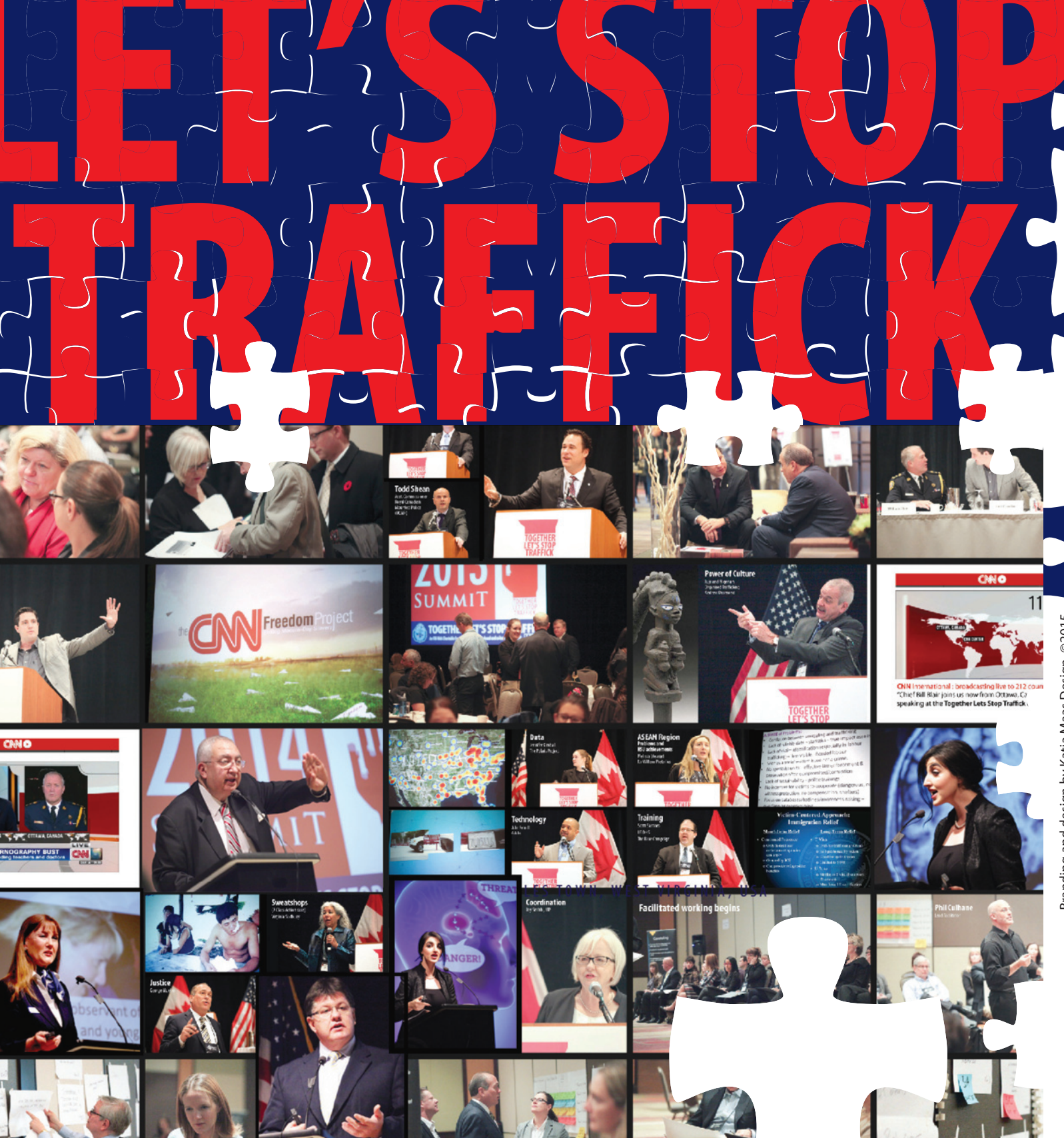
THE COLLABORATIVE INTERNATIONAL SUMMIT TO COMBAT HUMAN TRAFFICKING