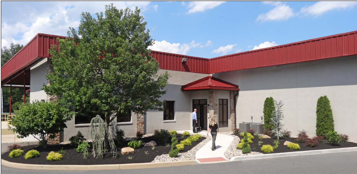
The new Medical coatings facility at Whitford headquarters in Elverson, PA, already ISO-3485-compliant.