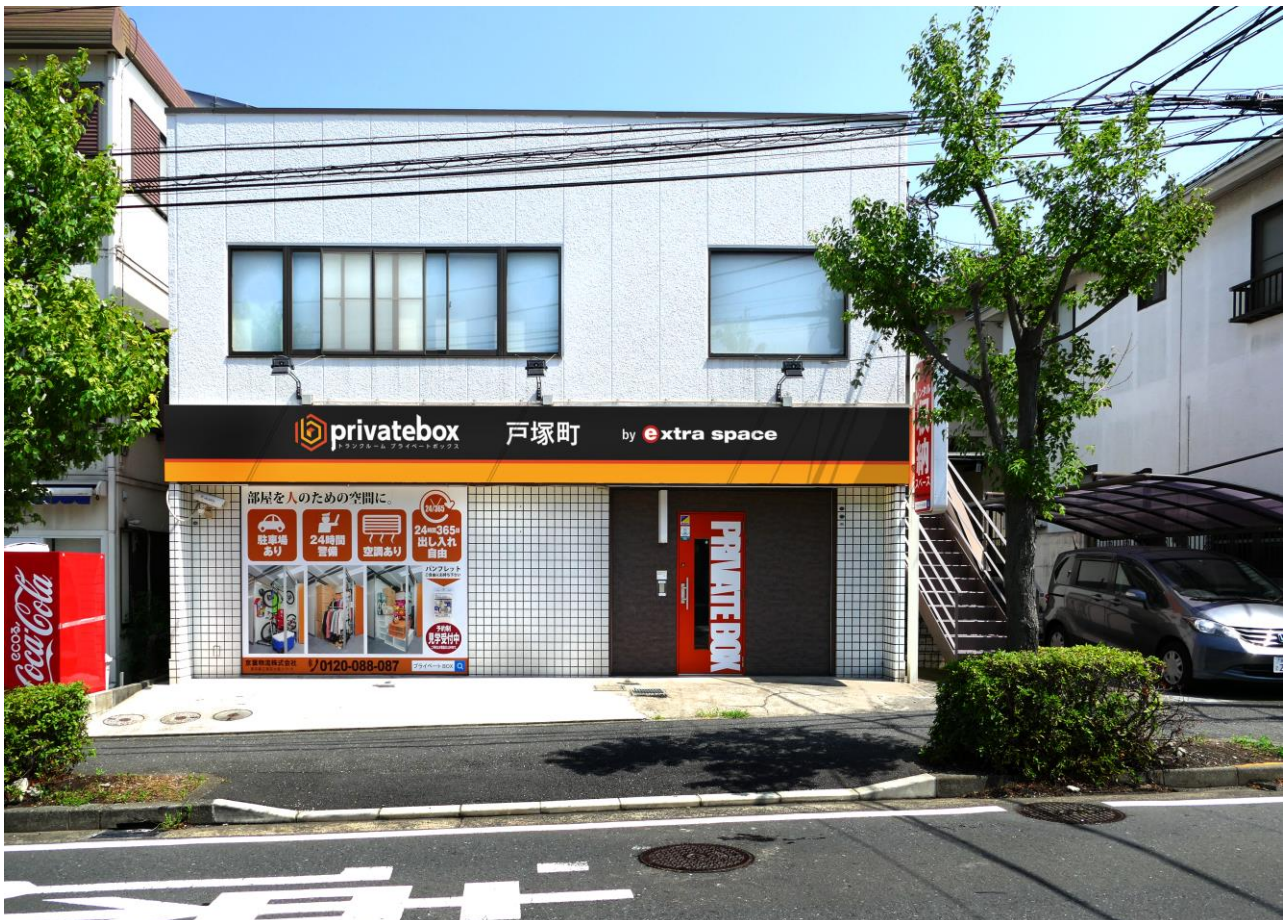
Private Box Totsuka-Cho storage facility, owned by Extra Space Asia, located at Yokohama.

Singapore, 11 September 2018 – Extra Space Asia has entered into a strategic venture with Keiyo Logistics to significantly expand the footprint of self-storage facilities in Japan. Extra Space Asia has committed to invest in self-storage facilities throughout Japan, and to work closely with Keiyo Logistics to become a dominant operator in Japan. Keiyo Logistics currently operates in excess of 75 facilities with over 6500 customers in Japan, primarily concentrated in Tokyo, under the brand “Private Box”. Facilities owned by Extra Space Asia will be managed by Keiyo Logistics under the brand “Private Box by Extra Space”. A leading pioneer of self-storage solutions in the Asia region, Extra Space Asia operates 33 facilities with over 12,000 customers across 5 countries (Singapore, Malaysia, Taiwan, Hong Kong and Korea) and is the largest self storage operator in the Asia region. The strategic venture between two of Asia’s leading self storage operators will allow them to grow market share in a rapidly expanding industry.