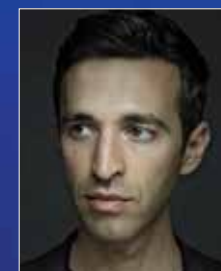
Anthony Roth Costanzo