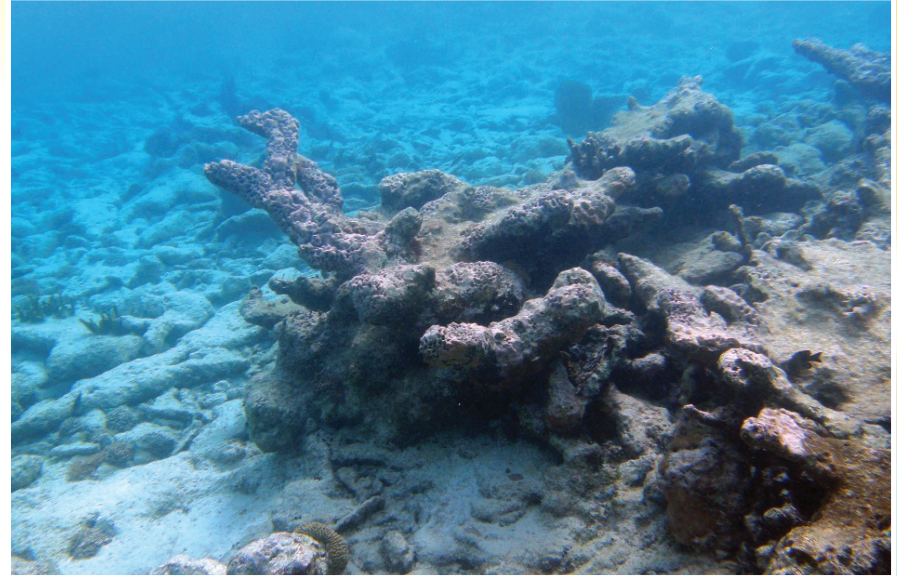
Coral Can Recover Once Chemicals are Out of the Water Scientific Evidence Shows Chemicals Such As Oxybenzone Are Deadly To Coral Known Carcinogens & Cause Hormonal Changes in Humans