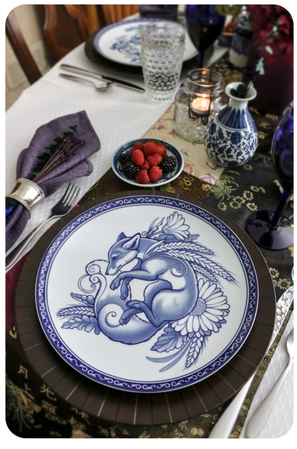
Wild Indigo 10.75" dinner plates with LilyKoi, GinkgoBunny, WheatFox, and FernSparrow designs by Jess Simmons. For high-resolution images, please see the Press Kit.