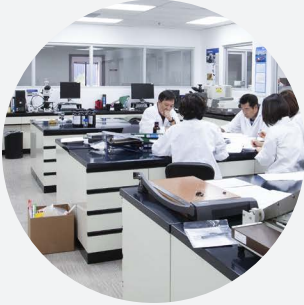
R & D

Complete solutions, from start to finish