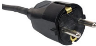
Intl Schuko 2-Pin Plug 16 Amp / 250V Rated / Grounded