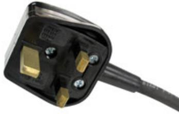
UK BS1363 Straight Blade Plug 13 Amp / 250V Rated / Internal Fuse