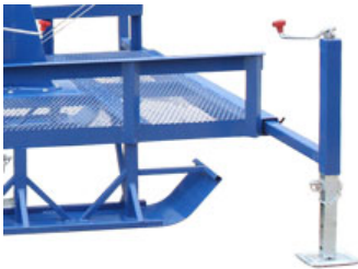
Retractable outriggers with 1,000 lb manual crank jacks.

The LM family of telescoping towers feature a proprietary mast guidance system, which provide increased stability during high winds. Four 1,000 lbs hand crank leveling jacks are used for leveling. The jacks can be leveled by hand crank or attachment provided for power drills. These outriggers can be extended 2` out from the side of the trailer for added stability. When lowered to 13`, the mast can withstand winds up to 125 mph. Three additional 1,000lb jacks help prevent the skis and tongue from freezing to glaciers, or to help break the trailer and skis free after already frozen.