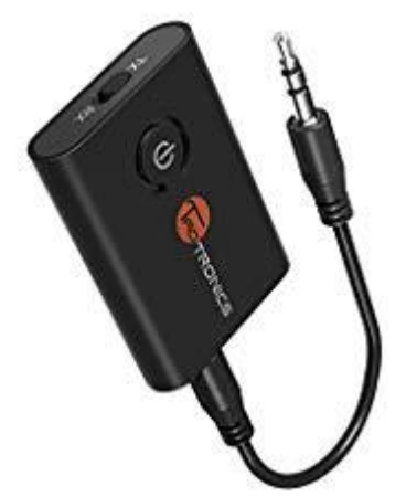
Figure 4: Compact wireless transponder. These devices can be paired with a wireless headset or earpiece to provide a private listening capability. The transponder can be plugged directly in to the kiosk's audio jack socket. Other brands and types of transponder are available.