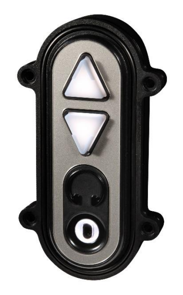
Figure 3. Tactile discernable sound volume controls must be easily accessible to those using assistive headsets, earpieces or hearing aid devices and those using headsticks or easy-grip styli.

4.2.6 To facilitate reliable and continued functionality, provision and installation of audio device connection points and/or permanently installed amplified speakers should accommodate requirements for regular sanitation (wash-down) procedures and should resist the hard use and abuse associated with ICT installations in public spaces. A minimum requirement for water and dust resistance in accordance with IP54 (or equivalent) should be achieved. A minimum impact resistance of 10J should be achieved.