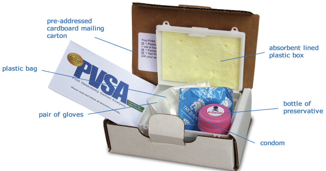
FIGURE 1 Picture of postvasectomy semen analysis (PVSA) kit

Service approved seamless plastic transport box with absorbent liners, originally designed to mail 15-ml urine specimens for testing. The instructions direct the patient to collect a semen specimen in the condom by either masturbation or intercourse, wait 30 min, then add the entire volume of the specimen to the bottle of fixative. The fixed specimen of approximately 8.5–13 ml is returned to the seamless plastic transport box with absorbent liners placed inside the pre-addressed cardboard mailer for return to a clinical laboratory for hemacytometer analysis.