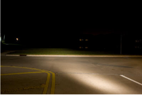
Shown above, vehicle headlights only...