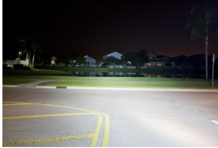
Headlights supported with LED light bar