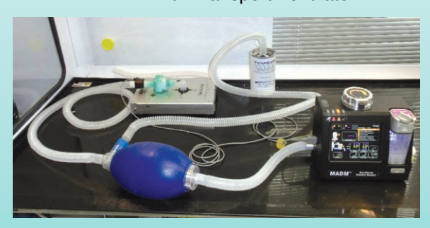
MADM™ with Resuscitator Bag