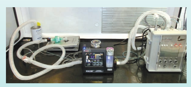
MADM™ with Transport Ventilator