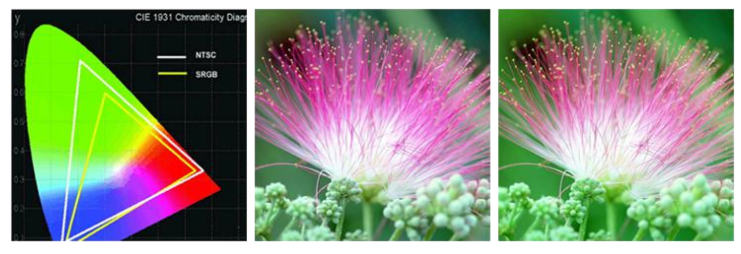
Color gamut space

RGB color reduction degree is high, color saturation, display clear, picture quality is more realistic and delicate.